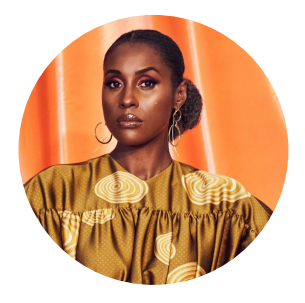
Issa Rae Actress, Writer, and Producer